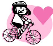
Lose the Training Wheels